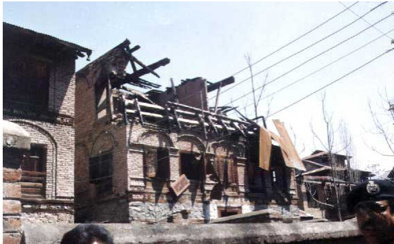
The ugly face of terrorism: Destroyed homes of community

In 1990, terrorism and sectarian violence caused nearly 500,000 Kashmiri Hindus to flee the land of their ancestors, the fabled valley of Kashmir in the Indian state of Jammu and Kashmir. These victims of terrorism, refugees in their own country, left behind virtually all of their worldly possessions, as they had to flee under threat to life and honor.