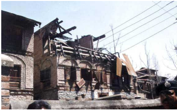
The ugly face of terrorism: Destroyed homes of community

The refugee camps in Jammu and Kashmir house hundreds of thousands of Kashmiri Pandits displaced from their homes as a direct result of the Islamic militancy in the valley. This tragedy has resulted in children being denied the opportunities that we take for granted. Since 1995, the Kashmiri Overseas Association, USA has implemented the Sponsor-A-Child Program for the age group 5 year olds to 17 year olds. This program aims to provide educational opportunities to the children directly affected by the tragedy. While individuals worldwide have contributed to these programs more children are in need of our financial support than currently available funds can support, there are many more that deserve our assistance.