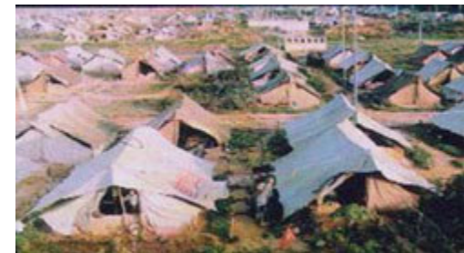
KPs live in squalid camps

KOA members' help toward the seriously ill KPs from Jammu is an act as noble as it can be - it is the epitome of compassion. And